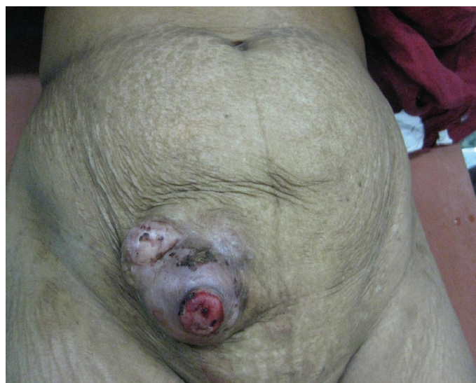
[Table/Fig-1]: Preoperative photograph showing the tumour

A 42-year-old female patient presented with a swelling in the right iliac quadrant of the abdomen [Table/Fig-1]. The patient was operated for the swelling at the same site two years back. The patient was symptom free for two years following her first surgery. Since one year, she noticed a swelling at the same site, which was increasing in size. As she was operated in a rural place, due to non-availability of histopathological facilities, the diagnosis was not proved. The examination revealed ulcerative right iliac swelling, approximately of a size of 20 × 15 cms, with bleeding and induration around. Pre-operatively, edge biopsy was done and the swelling was reported to be a spindle cell tumour. Sonography of the abdomen and chest X-ray and X-ray of the spine revealed no evidence of metastases. Wide excision was done under spinal anesthesia with a 3.5 cm clear margin and the tumour was freed from the rectus sheath. Primary closure of the wound was done after placing a suction drain. The post-operative period was uneventful and the patient